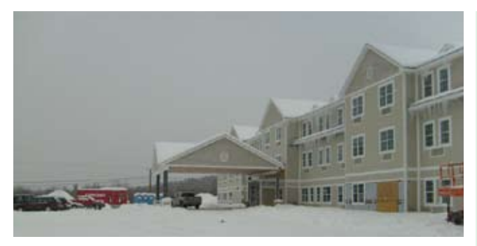
The Farmington/Wilton, ME Comfort Inn & Suites (86 rooms) opens in June 2008

A newsletter for the employees & friends of the Lafrance Hospitality Company