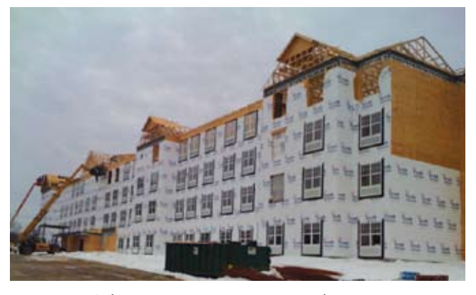
The Dover, NH Homewood Suites (88 rooms) opens in October 2008